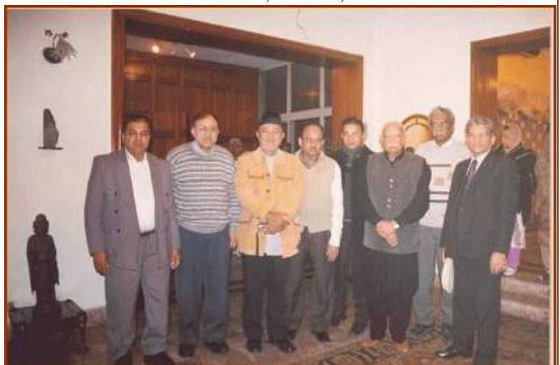
Hosting visitors at his residence