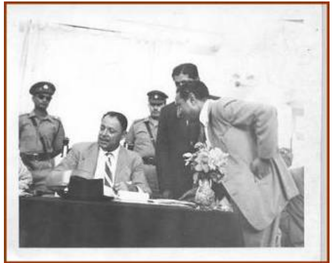
With President Mohammad Ayub Khan at meeting of Anti TB Society