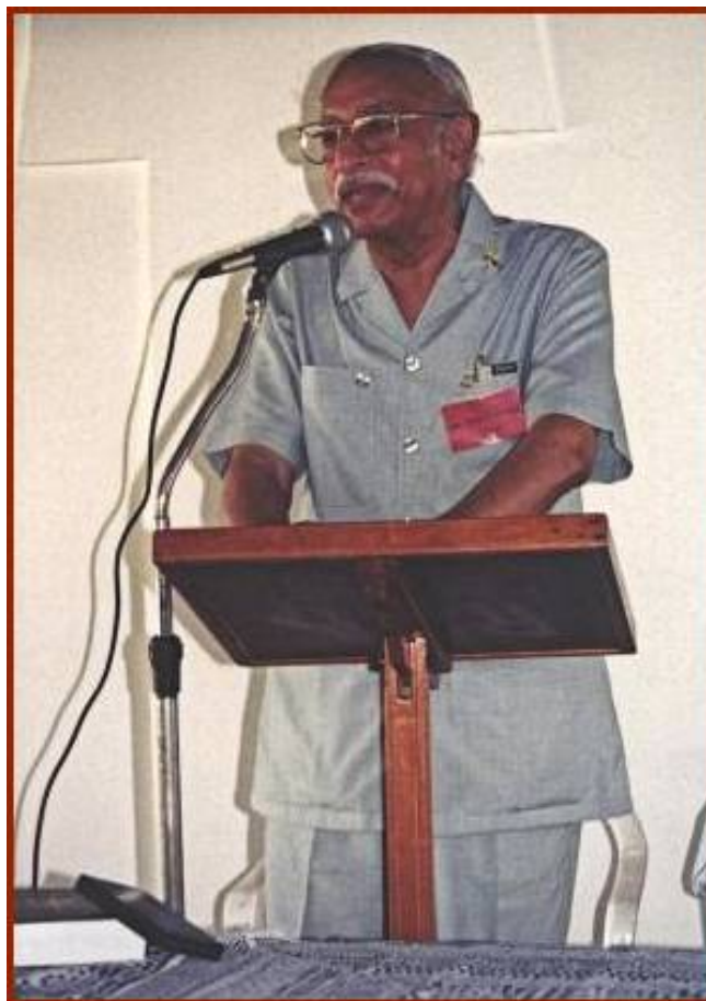
Suriname convention, August 1999