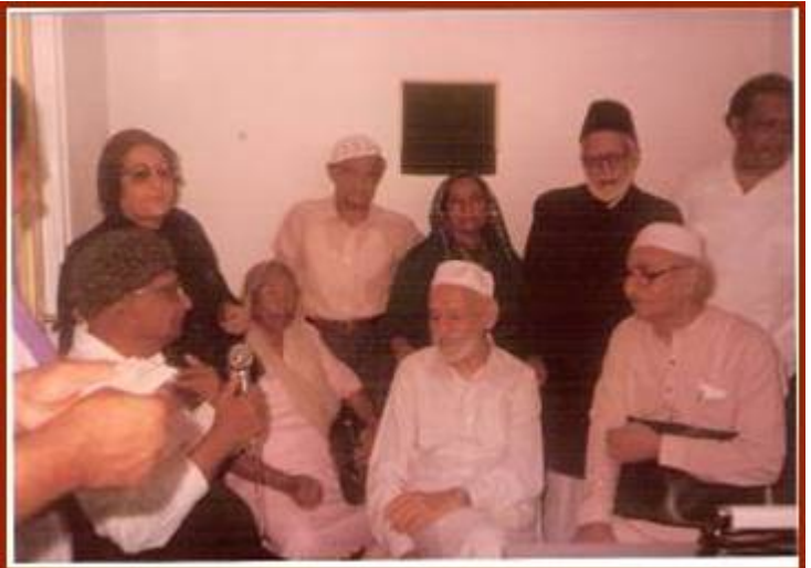
Unveiling of plaque ceremony, Paramaribo, 1984