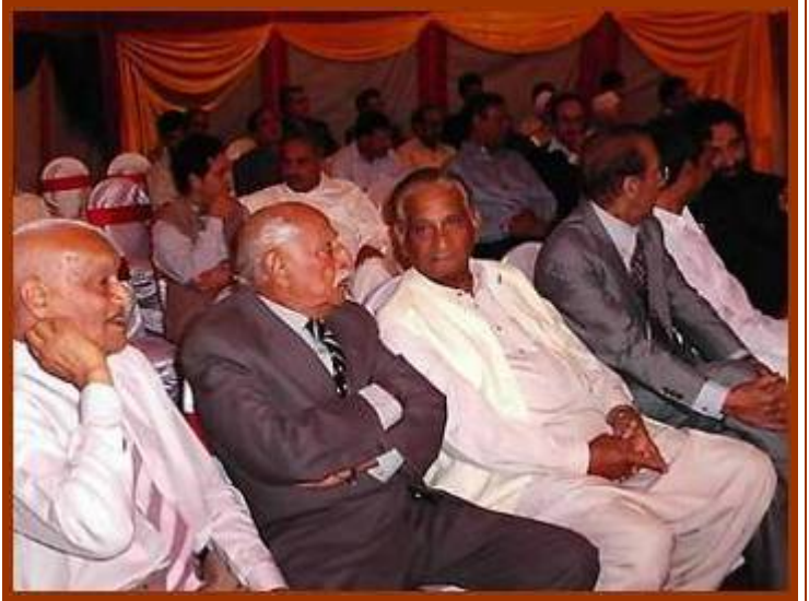
With members of the Jama'at at a wedding function