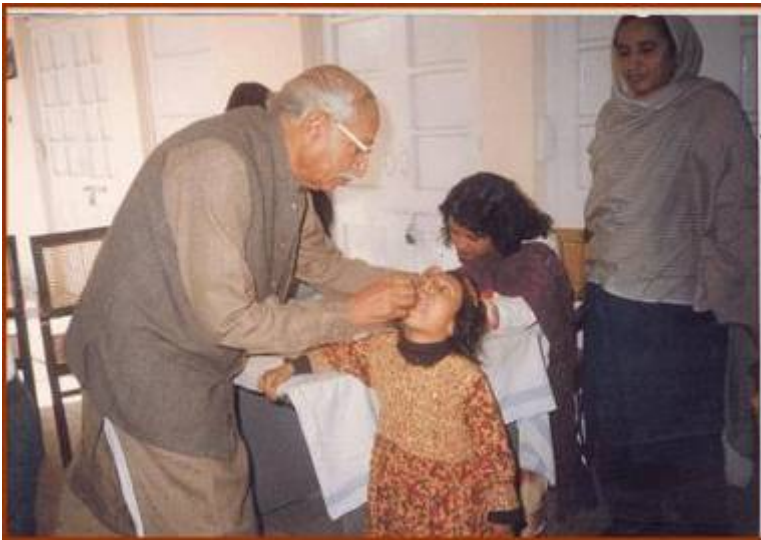
Administering polio drops to a child