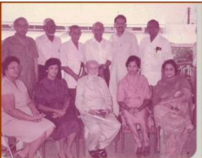
With delegates from Trinidad