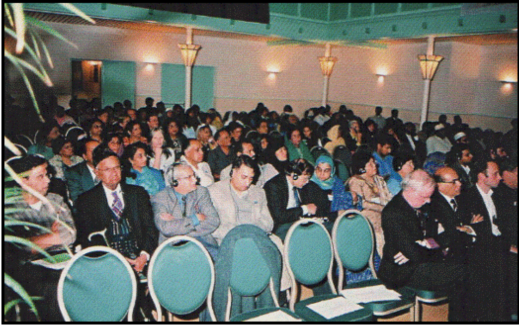
With foreign delegates at conference