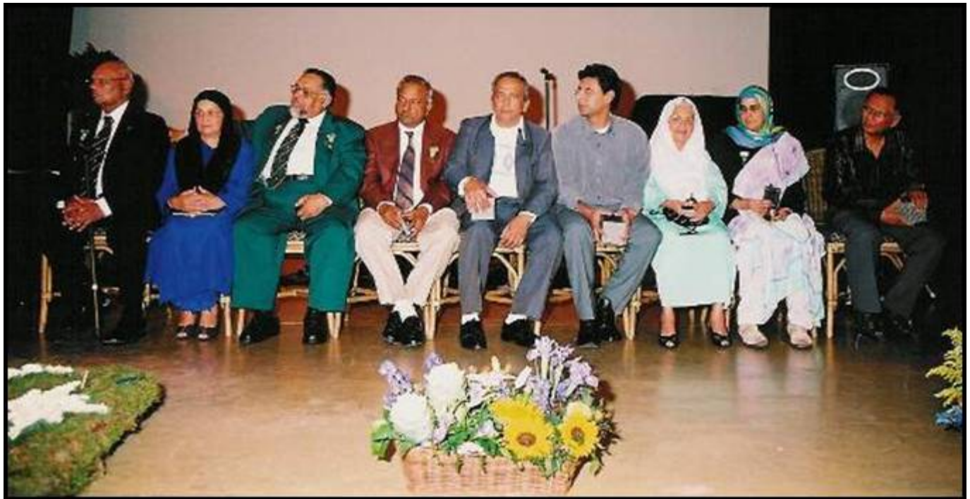
With other decorated Ahmadies