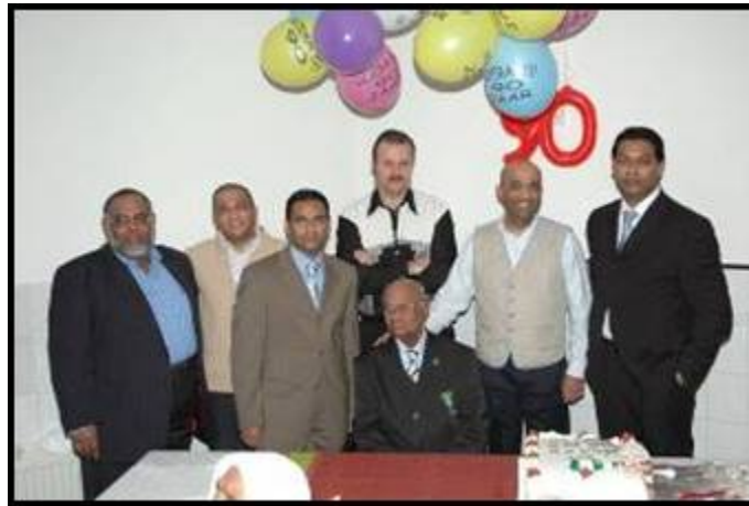
With Board Members