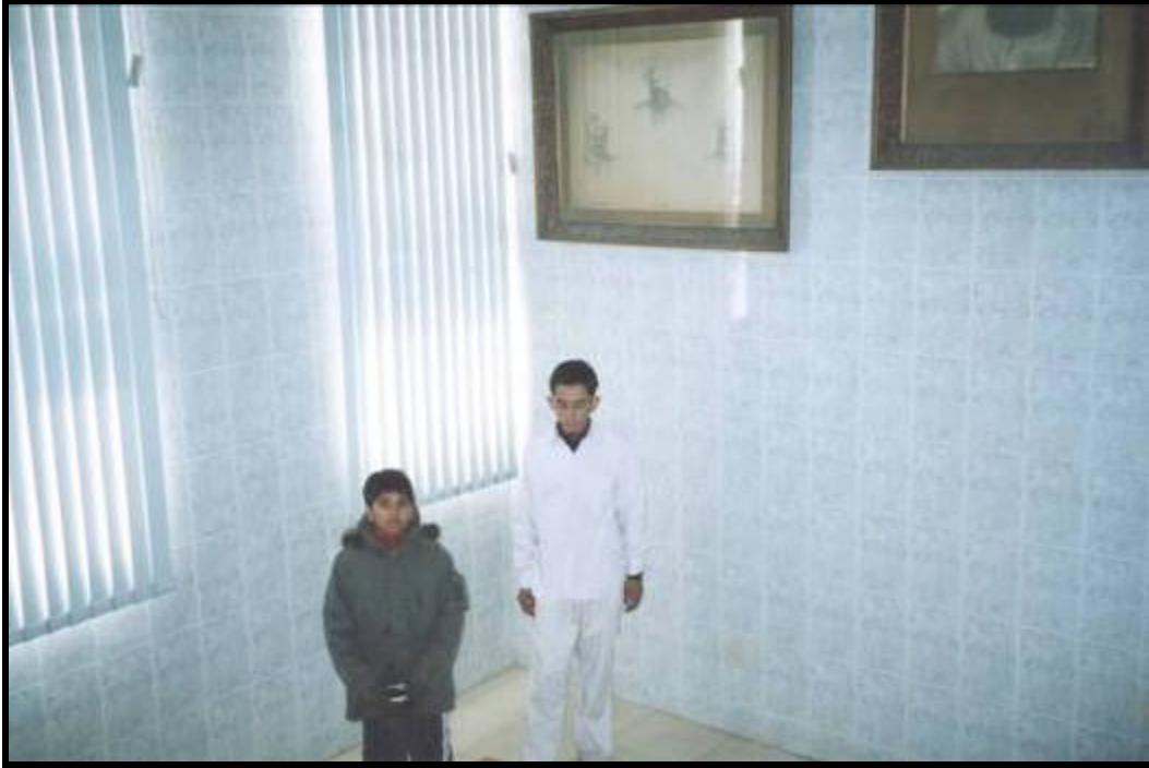
Promised Messiah Memorial Room, in December 2005 when the original decorative hardboard was replaced by glazed tiles with blinds on the windows