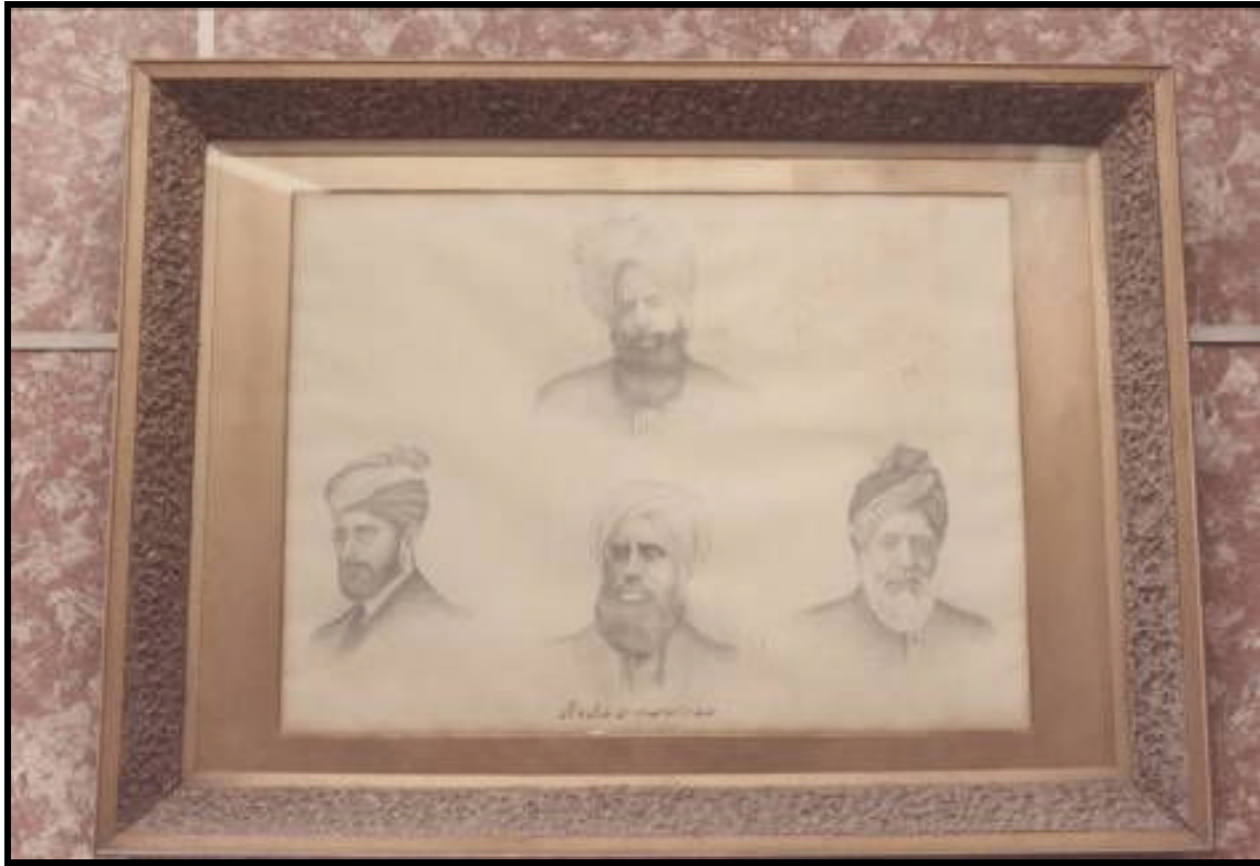
Portraits of Hazrat Mirza Ghulam Ahmad, with Hazrat Maulana Hakim Nur-ud-Din (centre), Hazrat Maulana Muhammad Ali (right) and Hazrat Maulana Sadr-ud-Din (left)