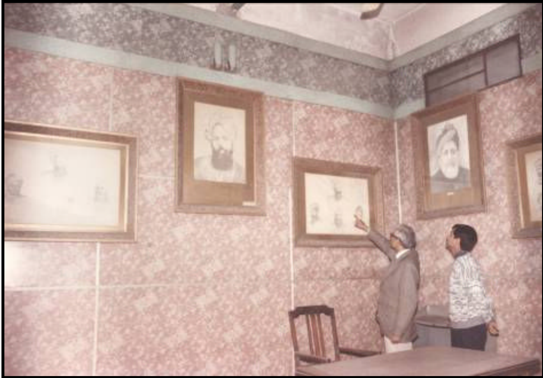
The Promised Messiah Memorial Room with decorative hardboard and portraits of the Promised Messiah and his companions on the walls