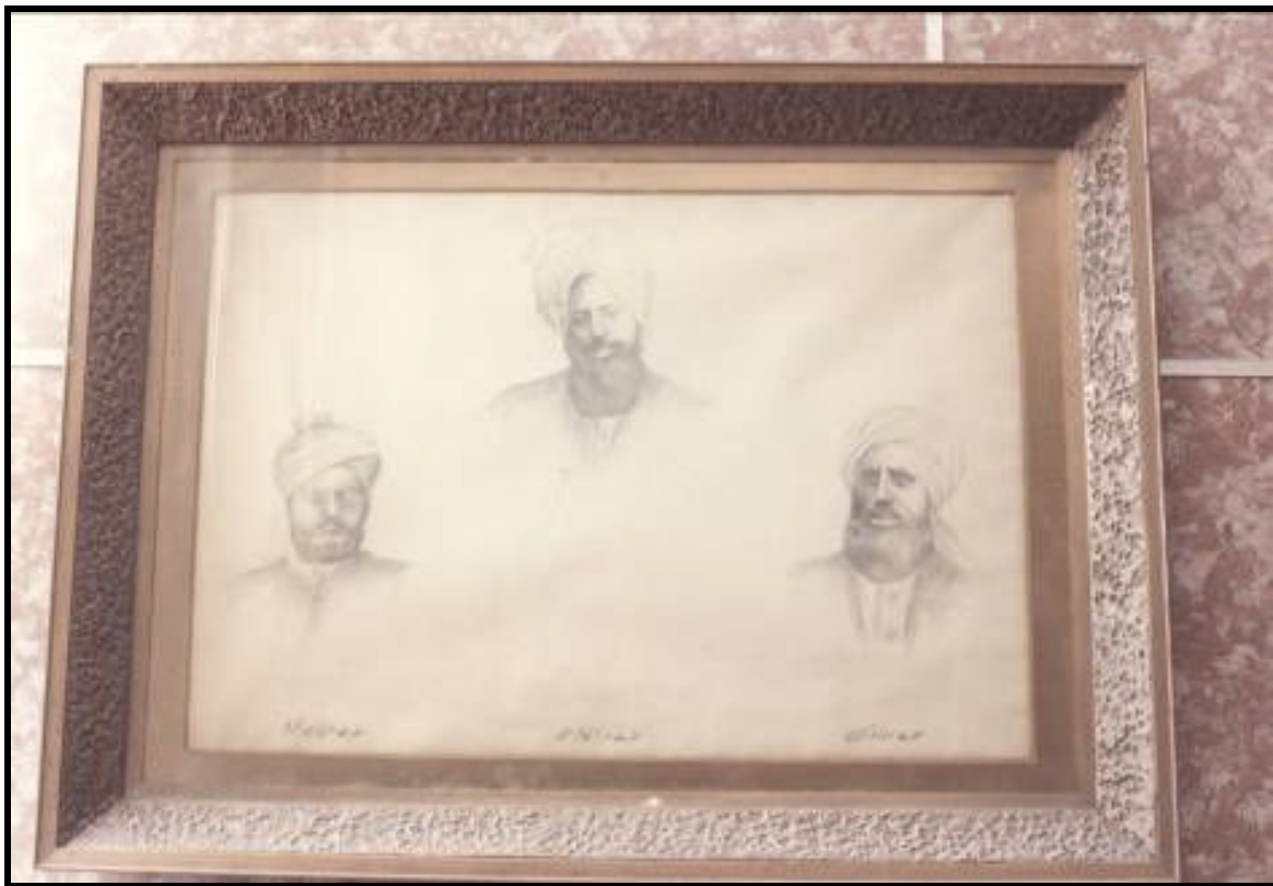
Portraits of the Promised Messiah (centre) and Hazrat Maulana Abdul Karim (left) and Hazrat Maulana Hakim Nur-ud-Din (right)