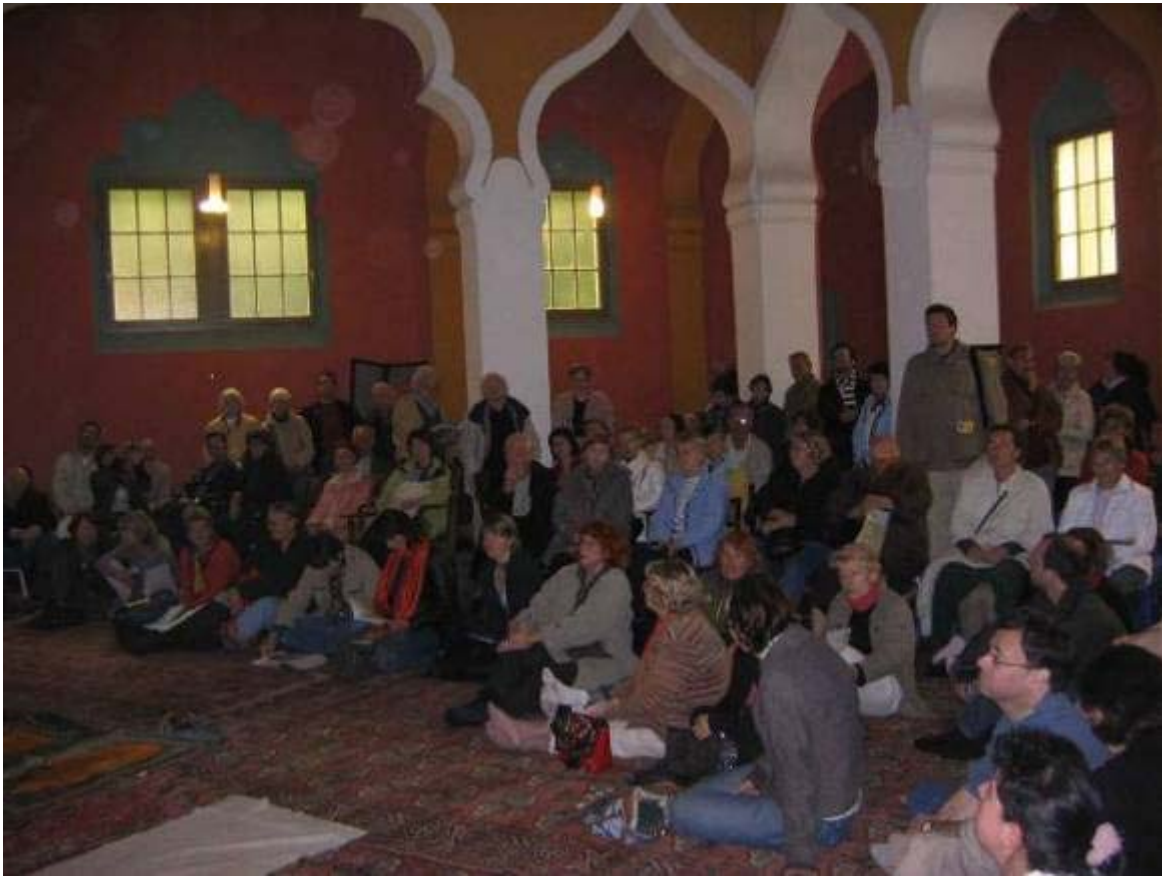
Another view of audience