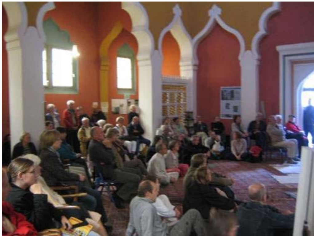
A view of audience