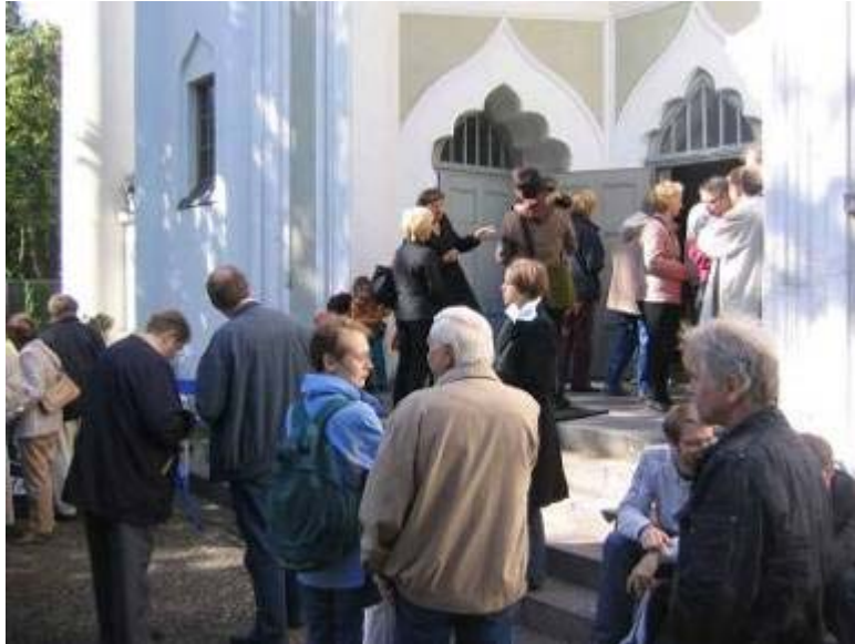
Visitors waiting outside the Mosque before the opening ceremony