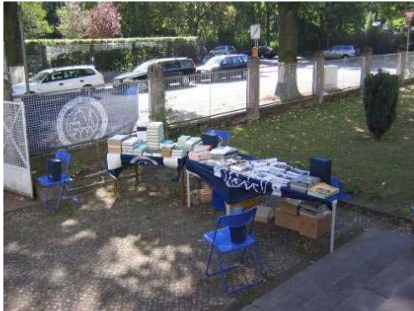
The stall which contained our books and DSD brochures