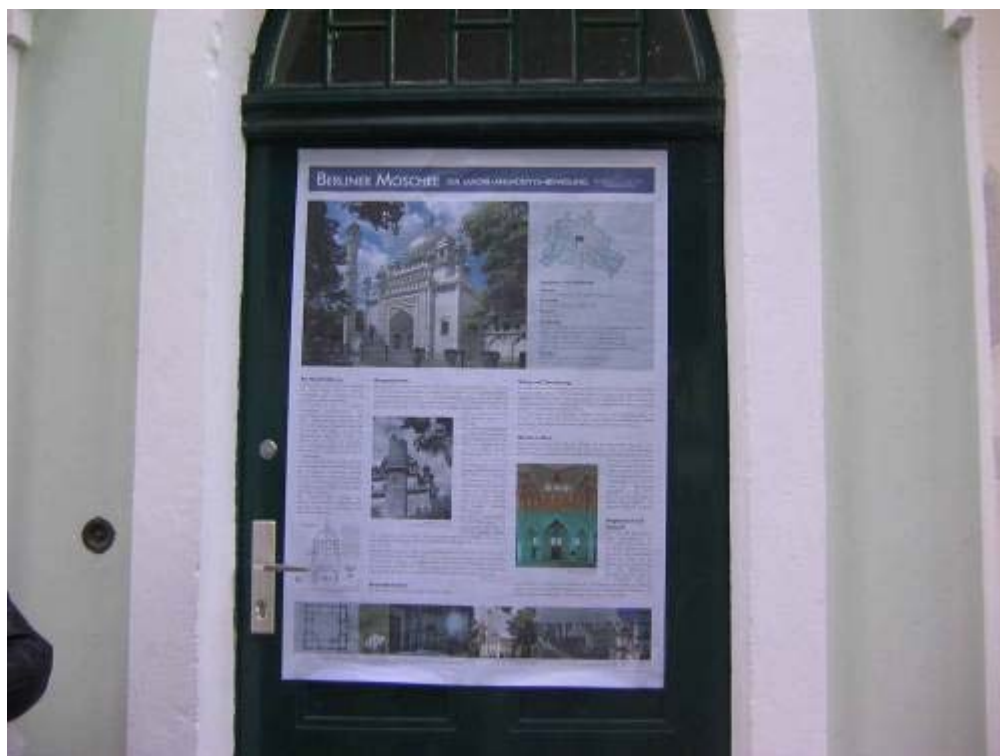
The poster prepared by the DSD for the Berlin Mosque