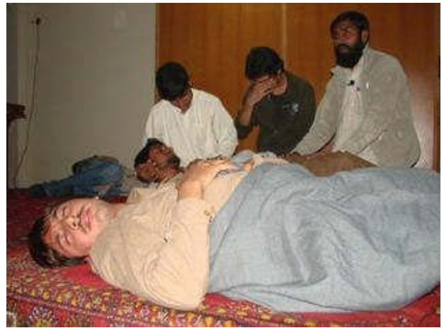
The juniors presented the Martyrdom of Sahebzada Abdul Latif Shaheed in the light of a poem written on the subject by Hazrat Mirza Ghulam Ahmad.