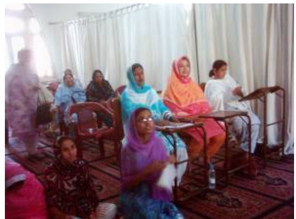
Sis Khalida of Suriname seated with local female students