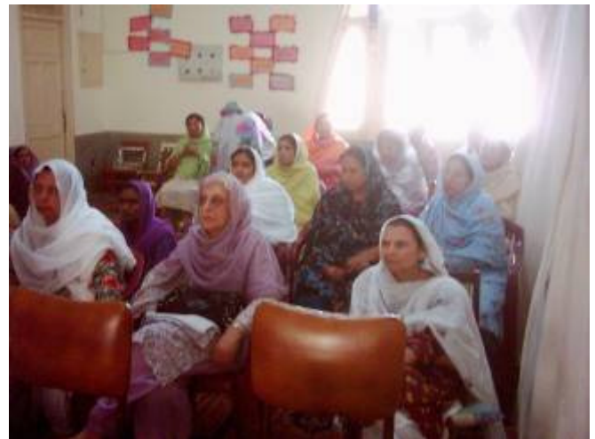
Ladies of AAII Lahore in the audience