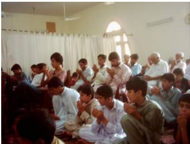
Taryabetti students pray with Hazrat Ameer