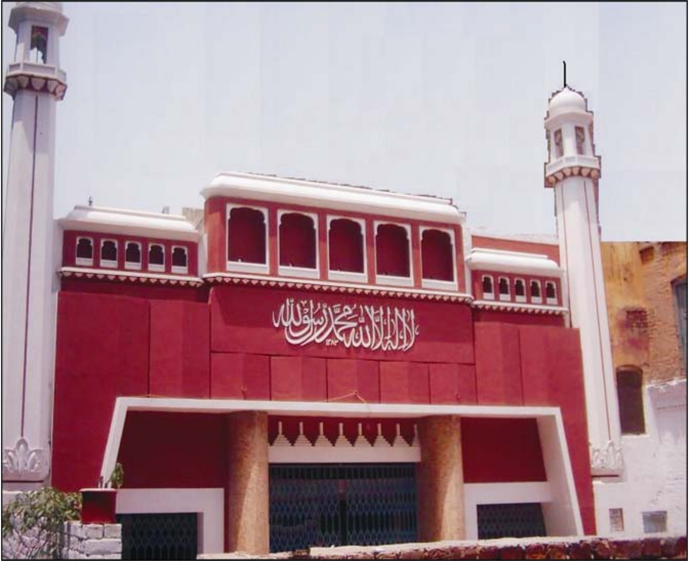
Ahmadiyya Mosque in Ahmadiyya Buildings, Brandreth Road, Lahore, Pakistan