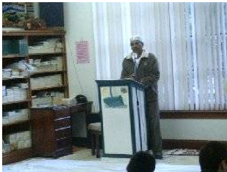
Introduction about Eid-ul-Adha prayer