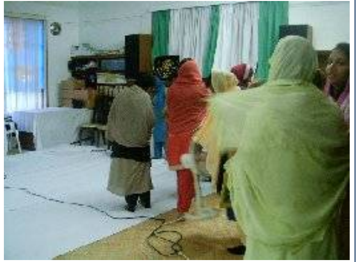
Forming lines before start of prayer