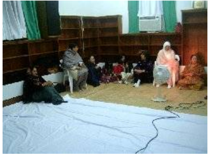
Waiting for the service to start