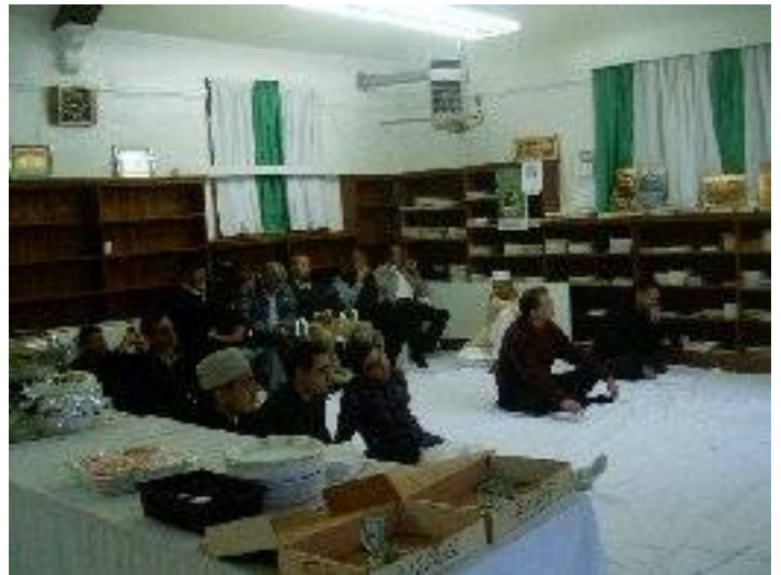
Listening to the service