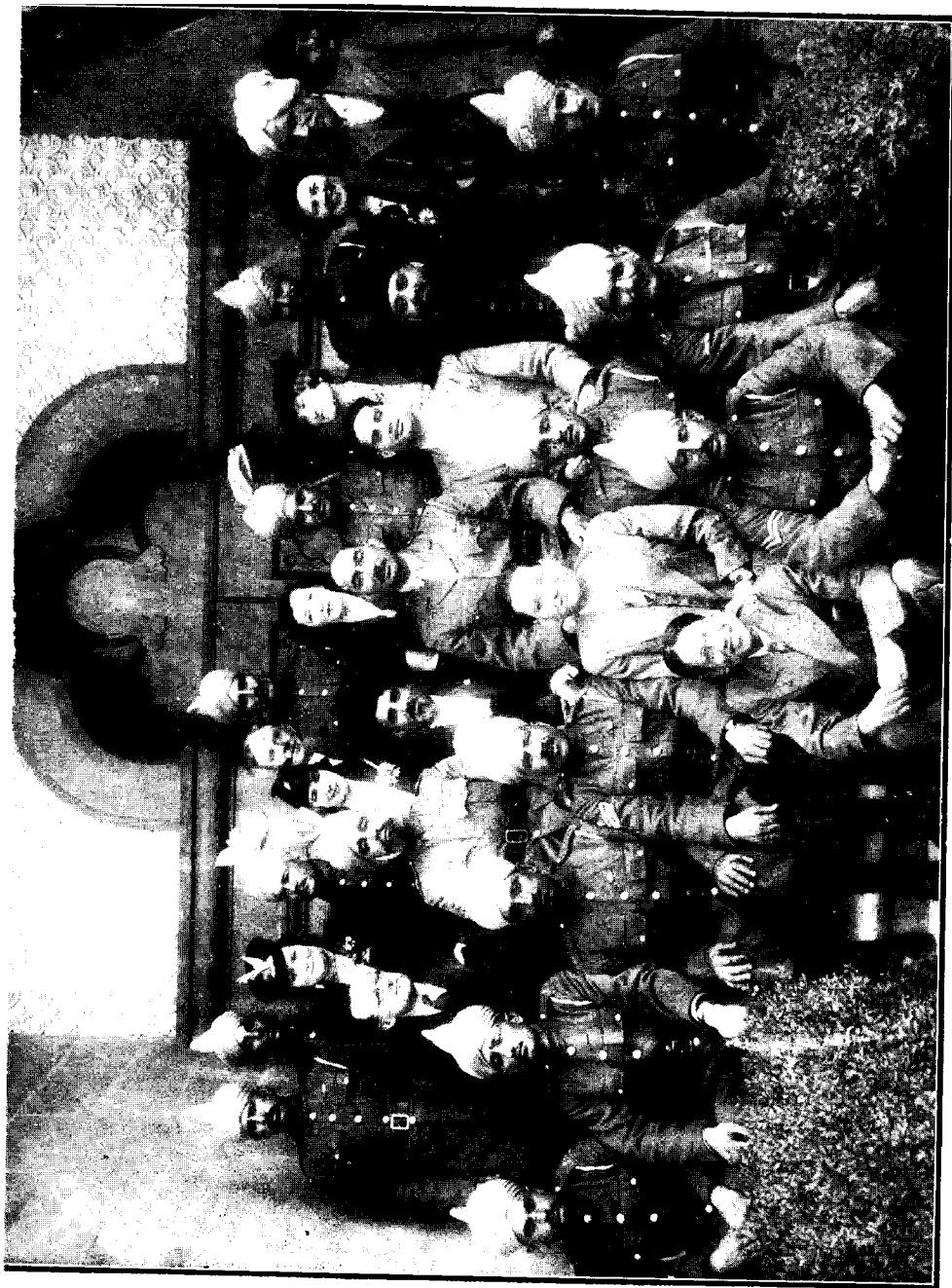
The first leave party from the Indian Contingent with the British Expeditionary Forces, at the Shah Jehan Mosque, Woking, to say their Jum'ah prayers on Friday the 10th May, 1940.